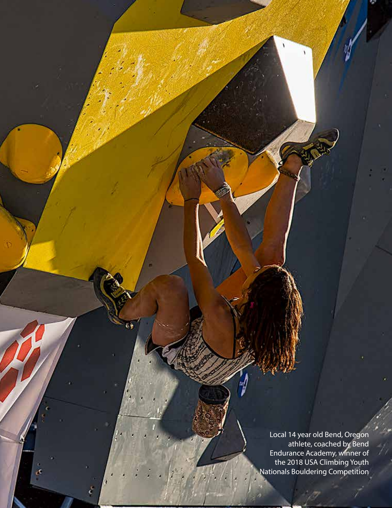
Local 14 year old Bend, Oregon athlete, coached by Bend Endurance Academy, winner of the 2018 USA Climbing Youth Nationals Bouldering Competition